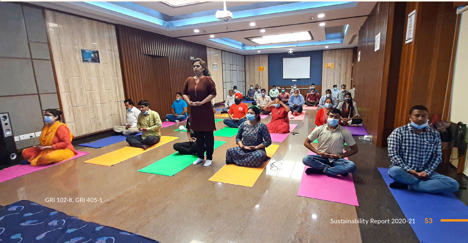
GRI 102-8, GRI 405-1