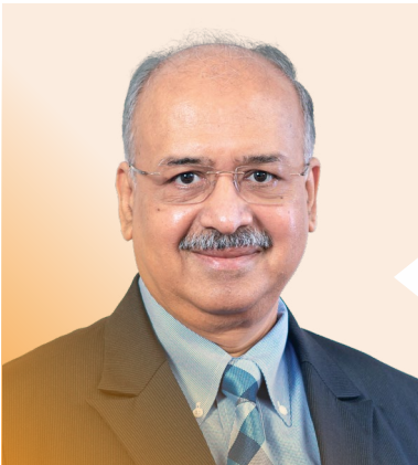
Dilip Shanghvi Managing Director