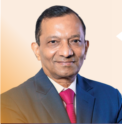
Dr. Pawan Goenka Additional Independent Director